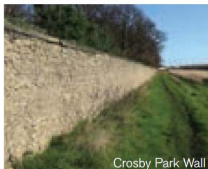
Crosby Park Wall

Cross over here and walk along Holgate which is directly opposite, continue ahead until you cross Broom's Cross Road at a traffic light controlled crossing. After crossing