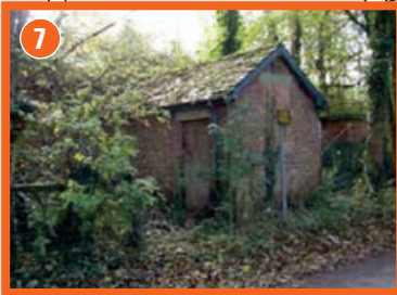
The Dead House