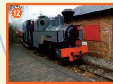
West Lancashire Light Railway