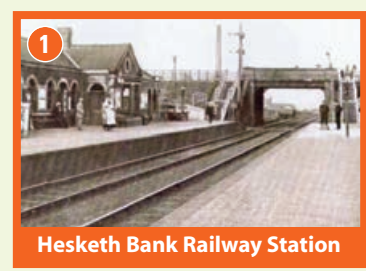
Hesketh Bank Railway Station