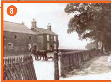
The Hesketh Arms