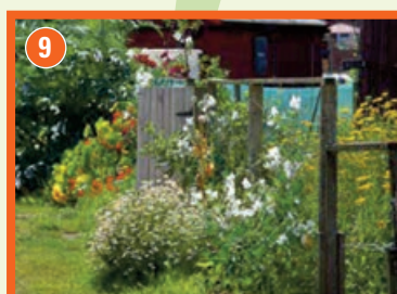
Poor Marsh Allotments