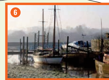
Hesketh Bank Boatyard