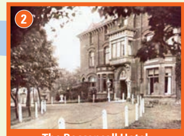
The Beconsall Hotel