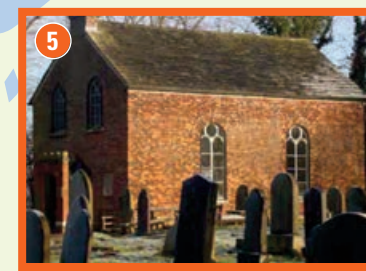
Beconsall Old Church