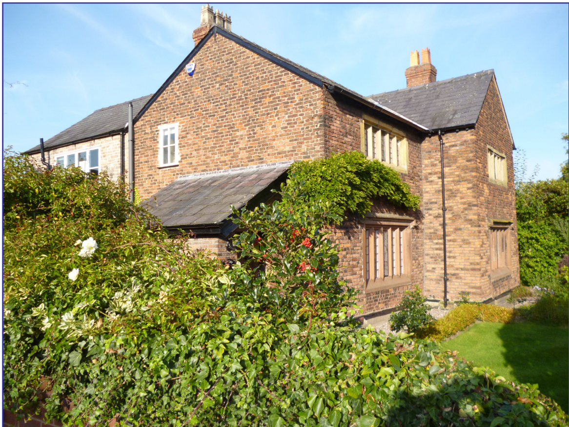
Plate MN 2.33- 2- North east view of Valley House (Site 21)