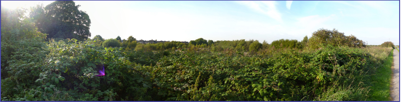
Plate MN 2.33- 1-View across MN 2.33 from North west to North east