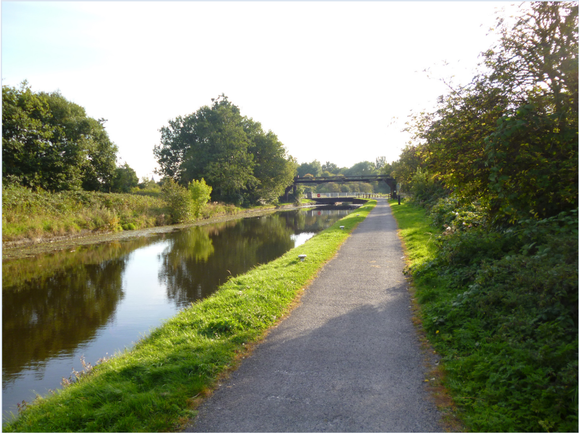
Plate MN 2.33- 3- South west view along the Canal towards Sites 16 and 17