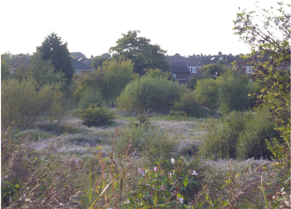
Plate MN 2.33- 4- View from Canal West to Valley House (Site 21)